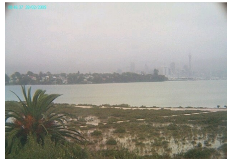
Auckland harbour as viewed from Shoals Bay; 10am on the day of the non-regatta.

Floodwaters surround a church in Kaeo.