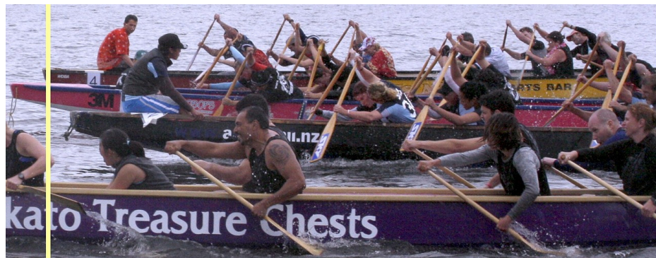
"Everybody paddles : EW holds out SKY to take third in the grand final."