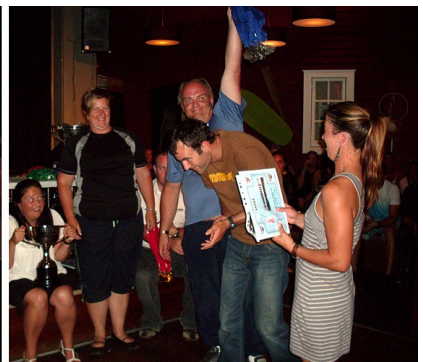
Silver Medal Winners