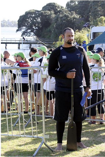
You shall not pass!

Ahhh, but the nominees for Arch rival of the year – EW had not yet raced against the Airforce who had put in times of 2:06.53, 2:08.49, and 2:06.99. Now, for those interested in one-upmanship it is worth noting that in the Warm-up round EW set a time of 2:05.8 and the Airforce set a time of 2:09.91; So EW had the fastest overall 500m time! Yes we are better than the Airforce and will rule the world [Insert maniacal laugh].