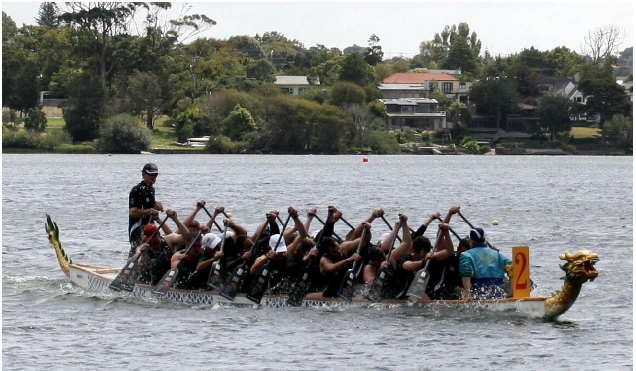
Lake Pupuke 2010