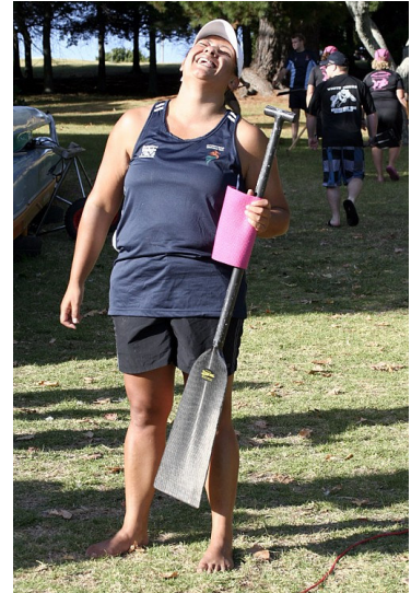
"I found these pills"

Environment Waikato once again competed at the Lake Pupuke NI Regionals. Ahhh, Lake Pupuke; that body of water somewhat