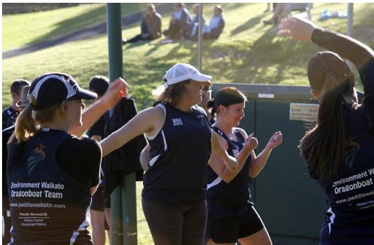
EW Dance troupe in training

All in all it was a good day – the weather was kind to us but it got a little bit cooler towards the end of the day. After the final race it was off to R'totos bar just a skip hop and a jump away from the racing venue to warm up with a beer or two and refuel the tank. Environment Waikato was awarded with silver medals which were well earned and we walked away happy with our result.