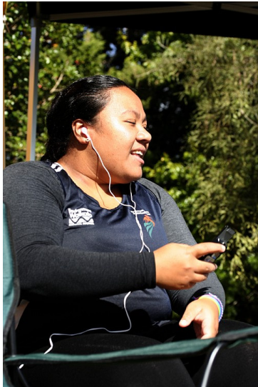
I've got these amazing new motivational tapes - the "Seven Habits of Highly Effective Paddlers" by Jimmy Heta.