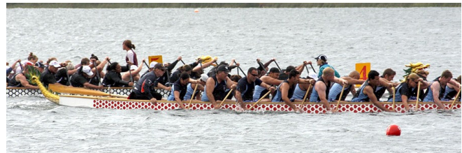
EW at the finish, a ½ boat length behind the Airforce and a ½ boat length ahead of NSC